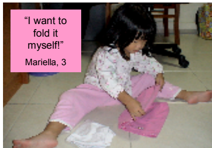
Fostering love for independence and responsibility